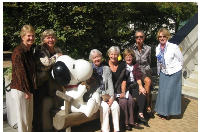
October Cultural Excursion group visits Snoopy at the Charles Schultz Museum.