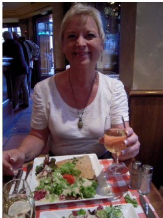
Lunch in Montmartre